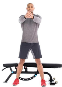
Bench squat with rotational chop.