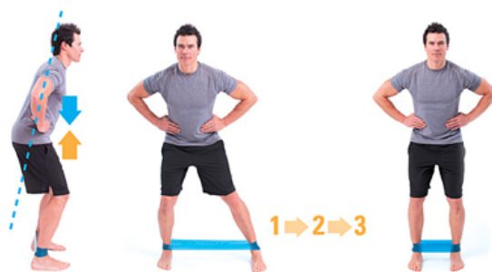
Mini band crab walk