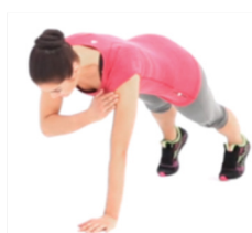
Straight-arm plank with shoulder touch.