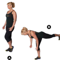
Single leg Romanian dead lift.