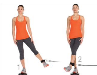
Standing Machine Hip Adduction.