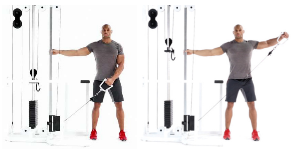
Standing shoulder cable raise.