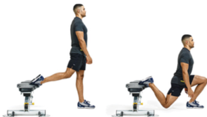
Dumbbell Bulgarian split squat.