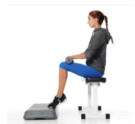
Seated double calf raise.