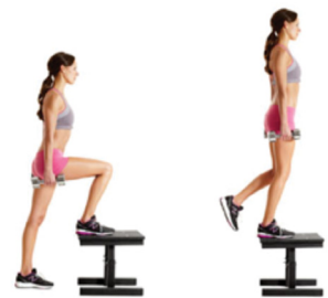
Dumbbell step-up onto 20cm box.